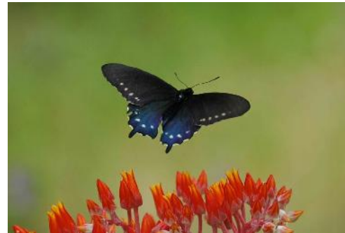
Pipevine Swallowtail Butterfly

The first insects to emerge from the depths of winter in the South Yuba River canyon are the native bees. Native mason and bumblebees begin to forage just as the very first native plants like the manzanitas are beginning to blossom. Pipevine swallowtail butterflies are usually the first and most common insect to be noticed by hikers. They seek nectar from a variety of flowers including lupine and spring vetch, and then they lay their eggs on the succulent leaves of the Dutchman's pipe or pipevine. The swallowtail's beautiful black and orange spotted caterpillars hide on the underside of the pipevine, but their presence is announced by the small black poop they leave on top of the leaves.